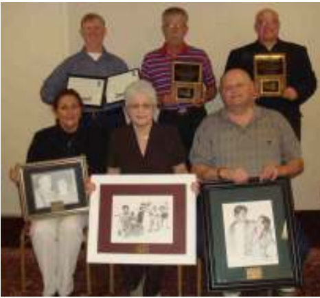
Top Picture L-R