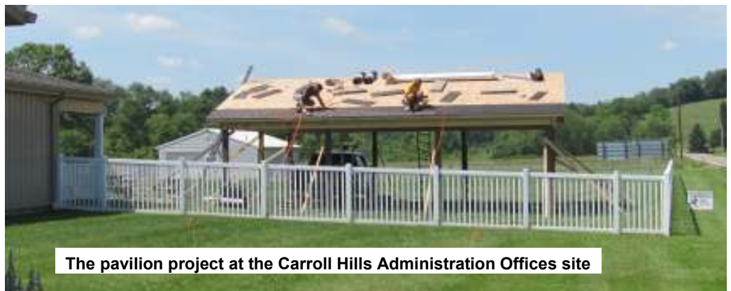
The pavilion project at the Carroll Hills Administration Offices site

A 24' by 30' pavilion will be built at the Carroll Hills Administration Offices site. This pavilion was requested by staff to better serve individuals in wheelchairs and allow more individuals to enjoy being outside. Carroll Hills Industries is exploring a document scanning contract. Individuals at the workshop will scan in documents to electronic format for agencies to store on a server or archive to a portable hard drive or CD. This will help agencies reduce storage costs, free up storage space, and improve the ability to retrieve documents. The document scanning process will also enhance the shredding service offered by CHI since the paper documents will need destroyed.