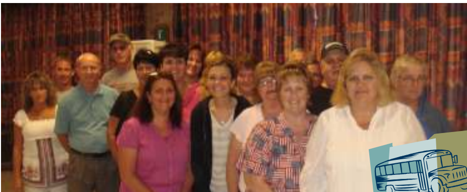
Carroll Hills Transportation Staff